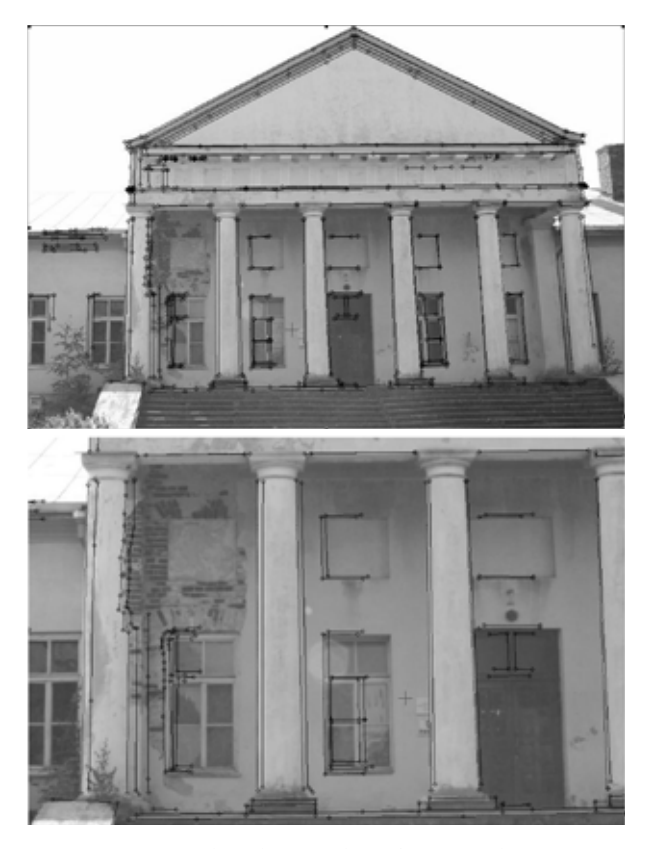
Fig. 5. Stereo digitalization data of mansion-house in Arnionys (continuous lines show the data from non-corrected images, dotted line – the corrected ones)

To evaluate the results of photo digitalisation, differences of the same 24 points in case of both projects were calculated. The deviations and the root mean square (RMS) of the measurements were calculated. The calculations are in Table 5.