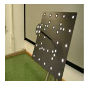
Fig. 1. Test-field for the camera calibration

For the calibration of camera the images of the testfield should be made at different camera positions and angles (Fig. 1).