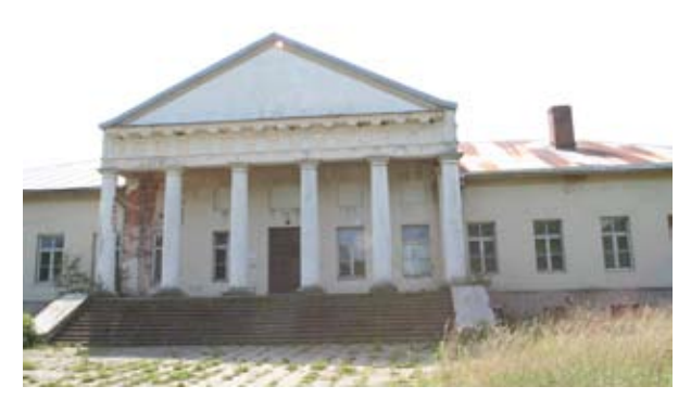
Fig. 3. Central facade of Arnionys mansion-house